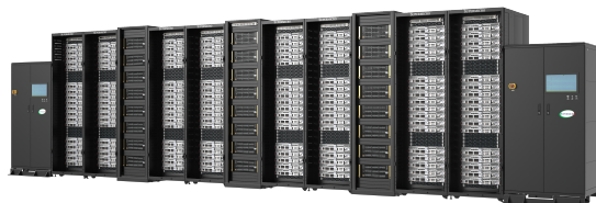
1152-GPU Scalable Unit