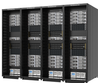
288-GPU Scalable Unit